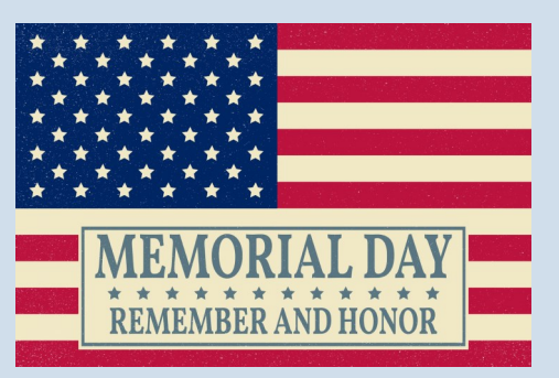
Monday, May 29th is a paid holiday in observance of Memorial Day.

This is just the beginning of our giveaway. There are 40 more opportunities for your chance to receive tickets in the coming months!